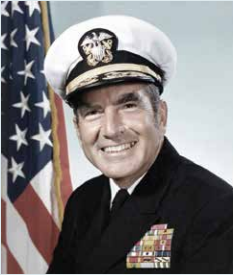
Admiral Elmo Zumwalt