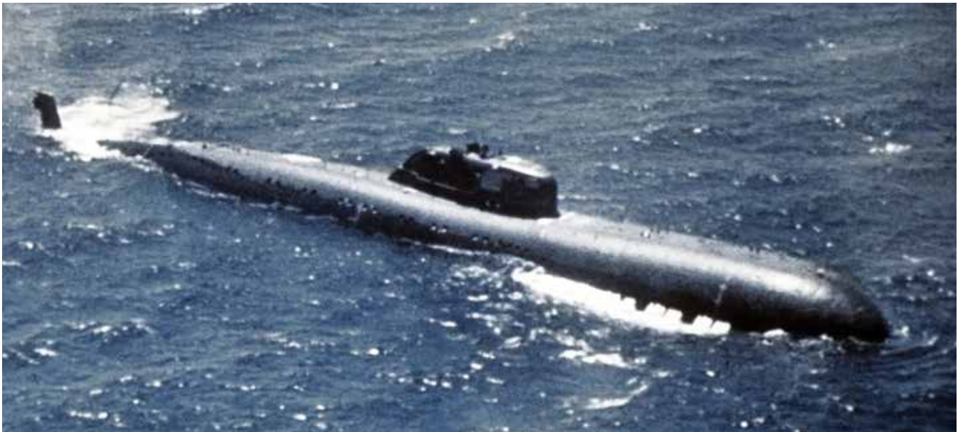
An aerial starboard beam view of a Soviet Charlie I class nuclear-powered submarine underway

War only reinforced Stalin's conviction that the USSR needed a large ocean-going navy. The Soviet leader pushed forward a large construction program that began producing cruisers and fast destroyers at about the time of his death in 1953. 3