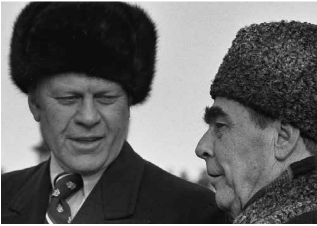
Gerald Ford and Leonid Brezhnev

“The seeds of the shift in the doctrinal development were already evident...in the Soviet classified writings dating from 1960–1962 passed clandestinely to the West by Colonel Penkovskiy.”