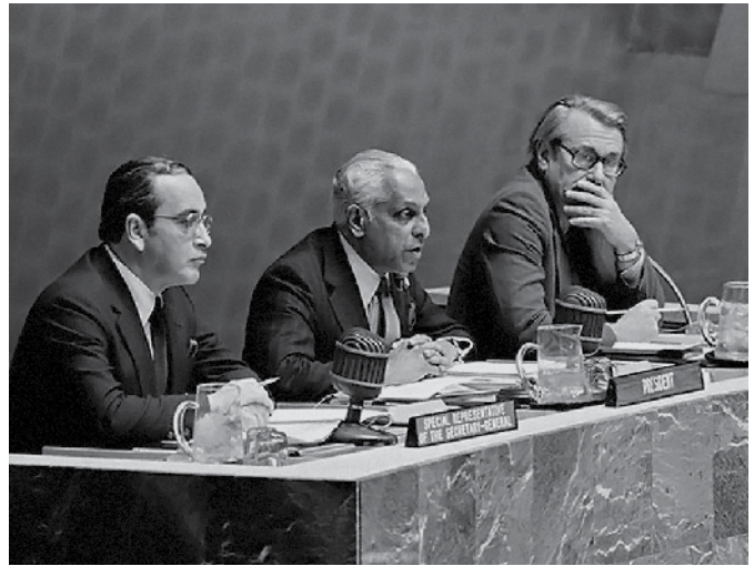
United Nations Convention on the Law of the Sea, 1980

NIE 11-15-82 and NIE 11-15-85, Soviet Naval Strategy and Programs through the 1990s , contain sections about distant naval operations short of war with the main naval powers. The major changes in Soviet posture followed construction of ships better suited to the mission. The estimates judged the Soviet use of naval diplomacy and power projection would increase during the 1980s and 1990s. 20 The 1980 Soviet Law of the Sea treaty negotiating instructions show the Soviets had changed their attitude about naval use of world oceans in two decades from one seeking to restrict Western naval access to one of virtually unconstrained transit of naval ships and aircraft. 21