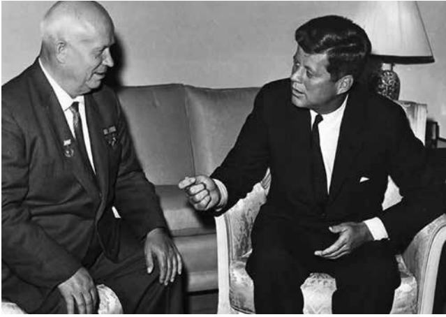
Nikita Khrushchev and John F. Kennedy

“In May 1956, the Soviet military publication, Krasnaya Zvezda ( Red Star ), contained the following statement: ‘Submarines, having atomic propulsion and guided missiles as basic armaments, can perform at great distances from their bases and secretly strike blows not only against ships but also against land targets deep in enemy territory.’”