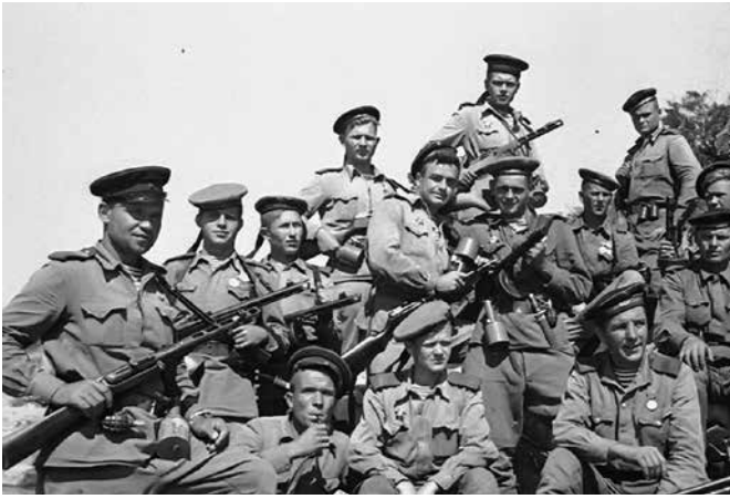
Soviet Naval Infantry

“All of the proposed reductions were meant to serve several purposes: to shift funds to the production of missiles and long-range bombers; to lessen the burden of military force requirements on heavy industry; to free labor for productive purposes in the civilian economy; and to bring international pressure on the United States to reduce its forces.”