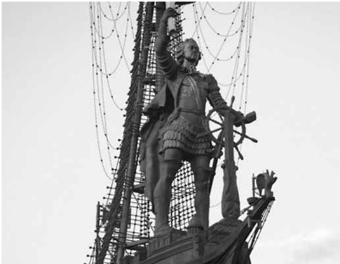
Statue of Peter the Great on the Moscow River

“As far back as the time of Tsar Peter the Great, the Russians sought naval access to the western seas.”