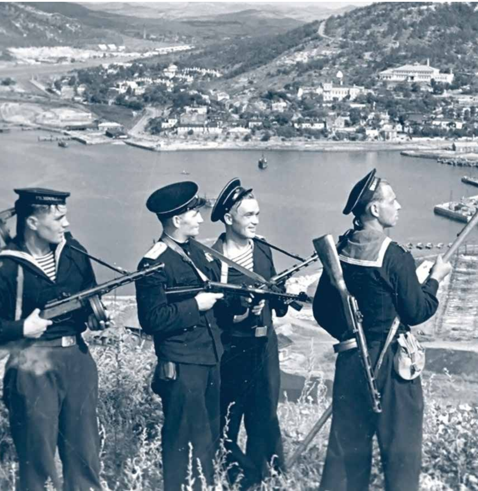
Pacific Fleet Marines of the Soviet Navy hoisting the Soviet Naval ensign in Port Arthur, 1 October 1945