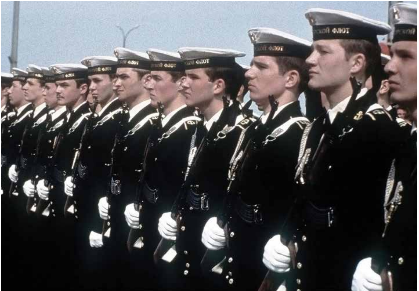
Soviet Navy Personnel—1982

range of Soviet targets. Gorshkov's vision of the Soviet Navy was still years in the future but signs were already appearing in the USSR naval-shipbuilding industry. The Soviets continued to produce long-range missile-carrying bombers and anti-submarine warfare aircraft, nuclear submarines, and had a broad array of major surface combatants under construction, including the Kiev-class aircraft carriers.