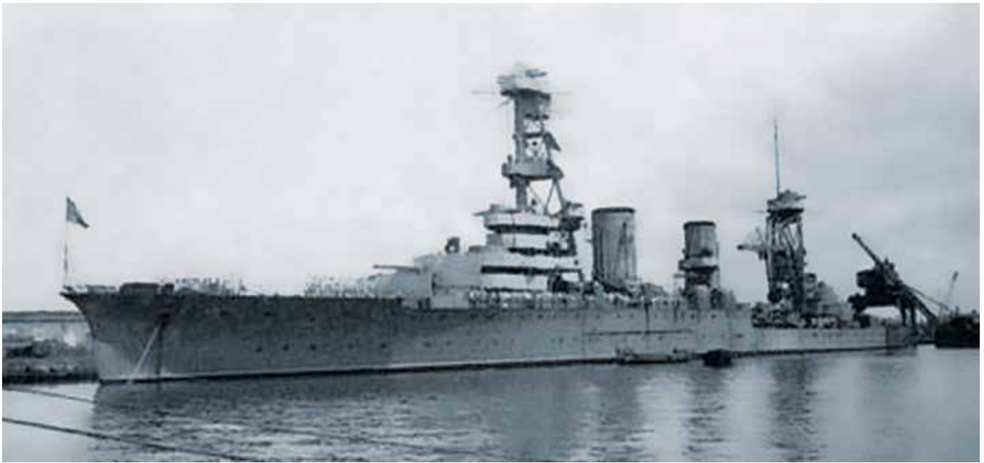
Soviet battleships—fighting U-boats in the Baltic Sea, WWII

The CIA intelligence reports, produced by the Directorate of Operations (DO) 3 made a significant contribution to understanding the history, plans and intentions of the Soviet Navy. Many of these documents are being released for the first time. These intelligence reports, however, do not represent the complete record—much information essential in the estimative process was from émigrés and defectors, as well as from the U.S. Navy, and imagery and signals intelligence, which are not specifically highlighted in this collection.