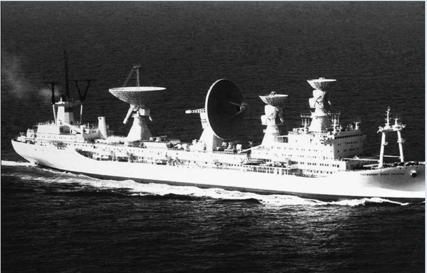
Kosmonaut Yuri Gagarin underway, 1986