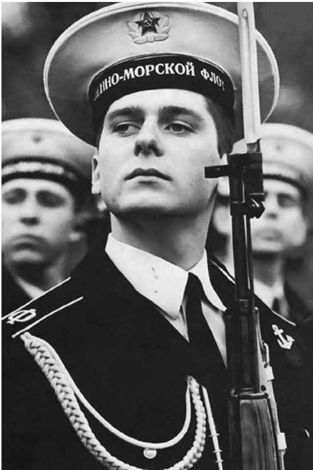
Honor Guard of Soviet Navy

“...Soviet naval deployments would eventually cover all areas of the globe—including the Caribbean. The Cold War at sea entered a new era.”